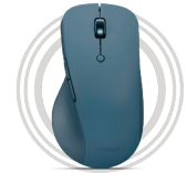
Lenovo Yoga Pro Mouse

* Full headphone functionality requires upcoming software update in Oct 2024.