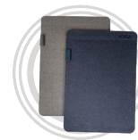
Lenovo Yoga 14.5" Sleeve